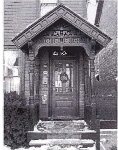
Reid Cottage, c.1880