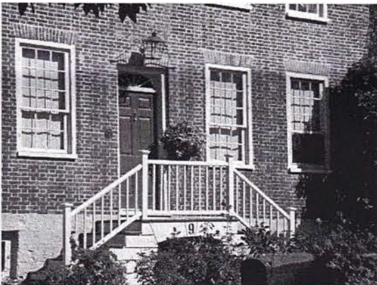
The Gardiner House, 1819

1992 Sept. 15 at Otterburn, 124 Centre St