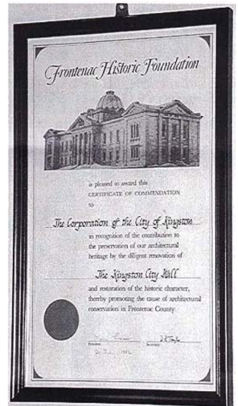
The first FHF award certificate was given in 1982 to Kingston City Hall, where it hangs in the reception lobby.

The award presentation ceremony normally takes place at a garden party (weather permitting) or indoor tea party and is usually accompanied by companion articles and photographs in local newspapers. It is the hope of the Foundation that the award presentations and accompanying publicity will not only give participating owners and others well-deserved recognition and personal satisfaction, but will also encourage the general public, especially owners of properties of architectural/historic importance, to take an active interest in the preservation of the local architectural and historic heritage.