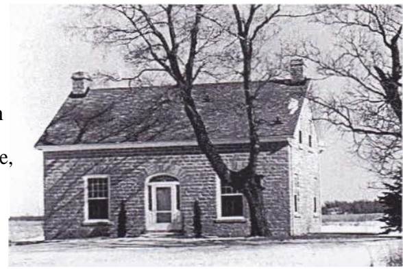
McCallum Farmhouse, c. 1831