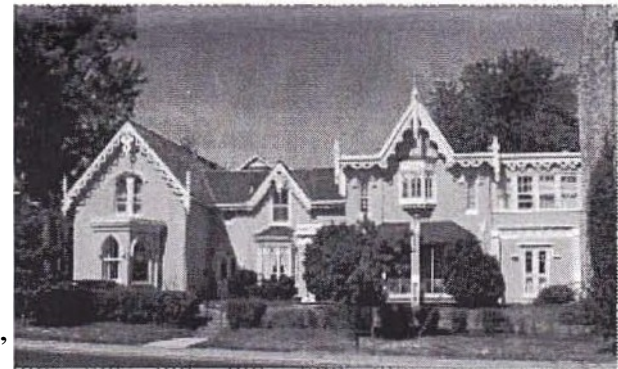
Elizabeth Cottage, c. 1846